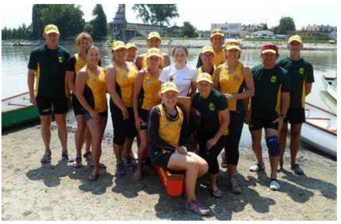
Members of Manly Dragon Boat Club who qualified for the Australian team, the Auroras, and competed at Szeged, Hungary